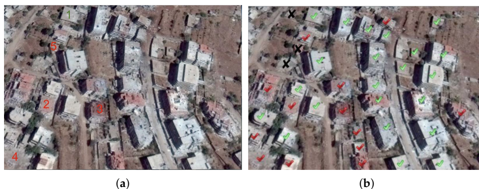
Figure 3. (a) Five labeled buildings investigated in details in Table 1; and (b) shows building damage assessment results of the proposed algorithm.

For Building 4, no shadow is detected in the post-war image and thus the relative building is considered as totally damaged. Generally, normal buildings have high spatial relation between their gray levels in addition to higher homogeneity, and vice versa. Therefore, normal buildings Variance and Correlation values are higher than those of damaged buildings. Building 5 is misclassified as a normal building due the absence of noticeable major structure deformation in the post war image, thus having low VD and low CD values.