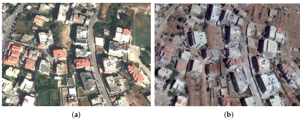
Figure 2. (a) pre-war; and (b) post-war original images for Zabadani Study Area.